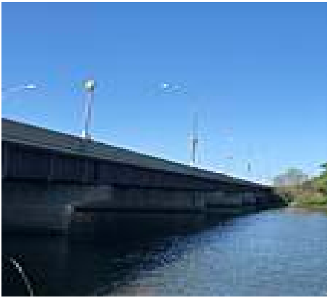
Cut State Park.

The Bauer Memorial Path provides a short route through residential and commercial areas of Machesney Park, a northern