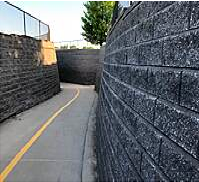
Shiloh Trail .

The Meadow Valley Trail is one of the more recent additions to Fayetteville's extensive trail network, and was the direct result of