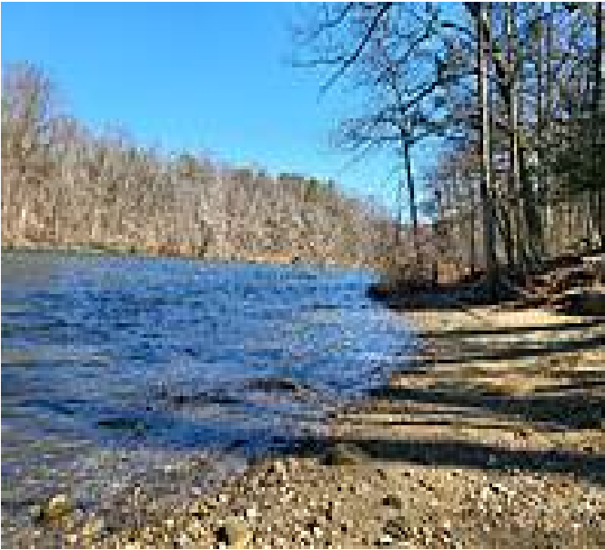
River Road at the trail's southern end to Brookfield.

The first phase of the New Milford River Trail runs southeast from Gaylordsville via the scenic but lightly traveled River Road, through