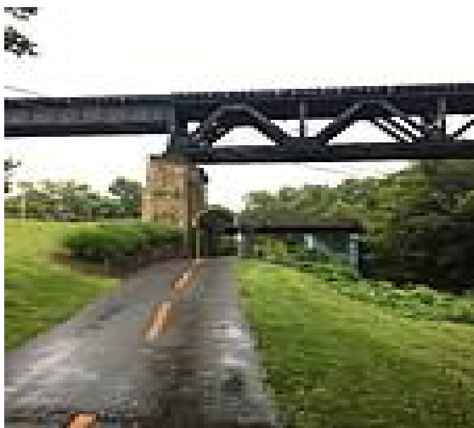
Luray from the greenway.

The Hawksbill Greenway is a 2-mile non-motorized pathway in the town of Luray, Virginia, two hours from Washington D.C. It extends