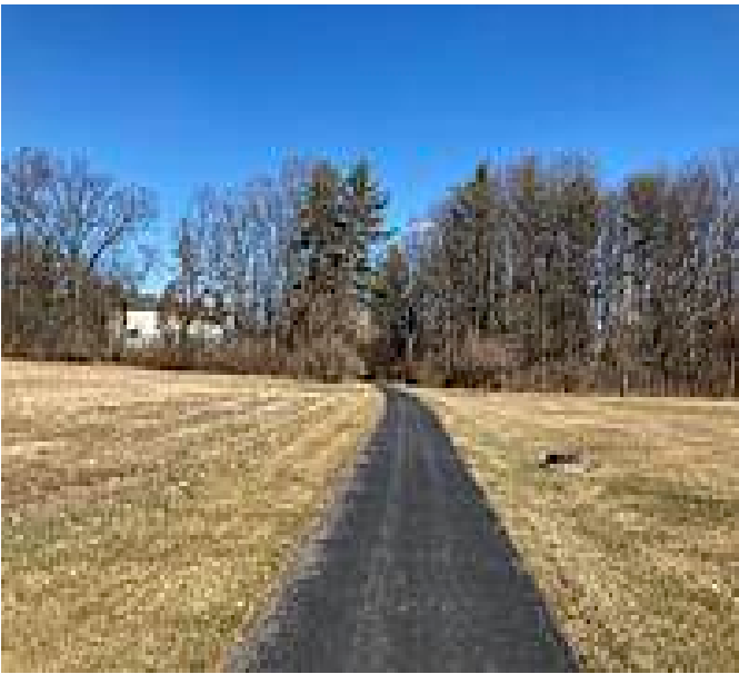
West Campus Bike Path.

Also known as the Circleville to Penn State Bike Path, the Tudek/Circleville Bikeway is a paved shared-use path with multiple