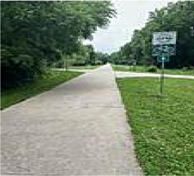
Lawrence Loop around the city.

The Burroughs Creek Trail and Linear Park runs from 11th to 23rd streets along an abandoned rail corridor just west of Haskell