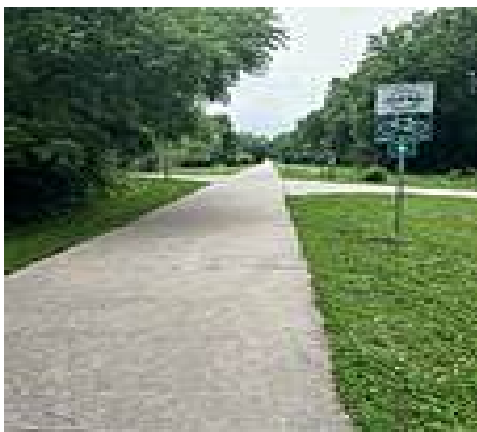
Lawrence Loop around the city.

The Burroughs Creek Trail and Linear Park runs from 11th to 23rd streets along an abandoned rail corridor just west of Haskell