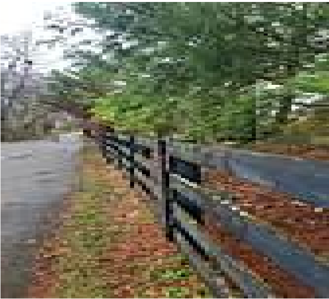
Rail Trail east to the Fayette–Clark county line.

The Brighton East Rail Trail was Fayette County's first, opening in 2007. The original 1-mile trail through recent residential