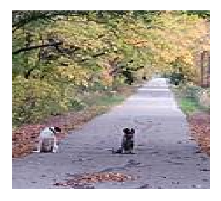
The T-Bone Trail stretches nearly 20 miles between Audubon and Pymosa township in western Iowa. The paved pathway follows a former railroad right-of-way and offers beautiful countryside views. On the trail's north end in Audubon is Albert the Bull Park; if you have the time, don't miss checking out its 45-ton, 30-foot-tall cow sculpture!

The T-Bone Trail stretches nearly 20 miles between Audubon and Pymosa township in western Iowa. The paved pathway follows a