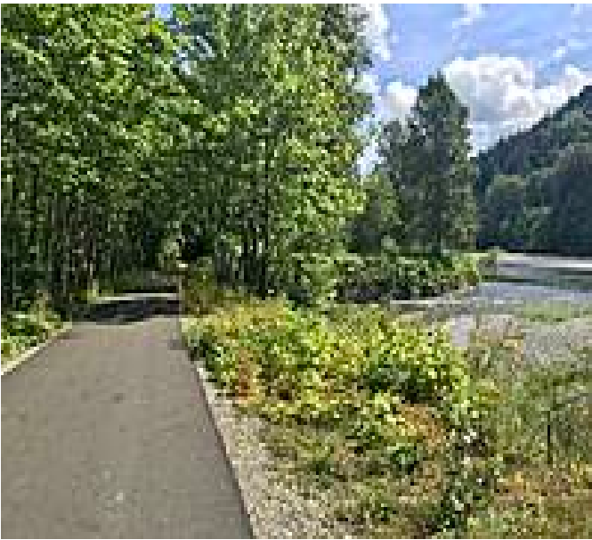
Centennial Trail in Arlington.

Closure Notice: The French Creek Bridge is closed until further notice. See Snohomish County for more current information. The