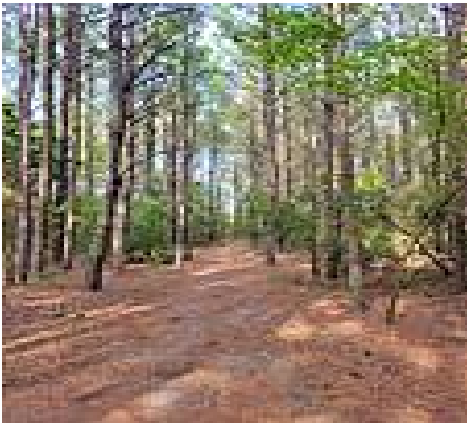
Road in Ocean View.

The Prickly Pear Trail is a 3.5-mile loop in Delaware Seashore State Park's Fresh Pond area. About the Route The trail runs through