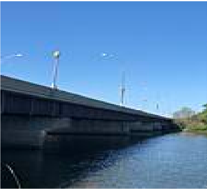
Cut State Park.

The Bauer Memorial Path provides a short route through residential and commercial areas of Machesney Park, a northern