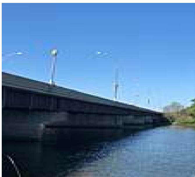
Cut State Park.

The Bauer Memorial Path provides a short route through residential and commercial areas of Machesney Park, a northern