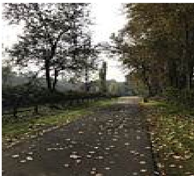
Orting and South Prairie.

The Puyallup Riverwalk Trail traces the tree-lined shoreline in northern Puyallup, a few miles southeast of Tacoma. The paved