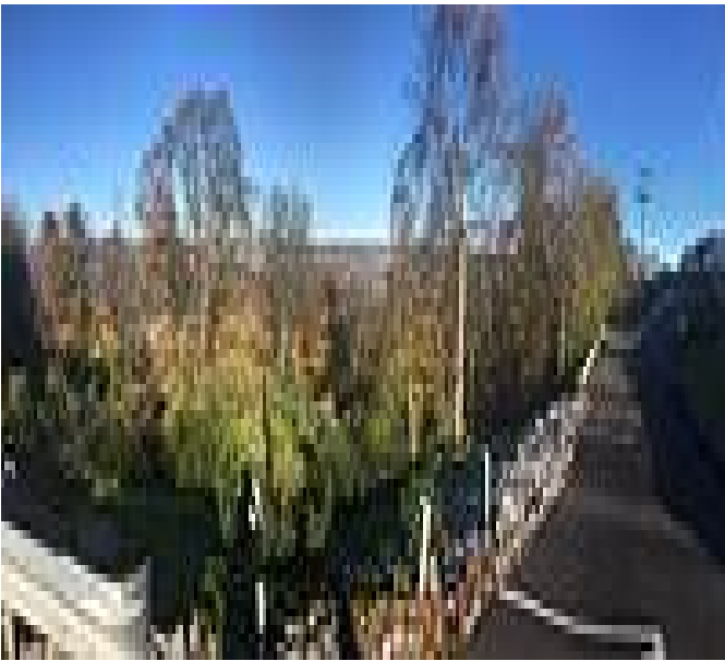
Chattanooga and Tennessee Rivers below.

The 5-mile Guild-Hardy Trail is a beautiful excursion on southern Tennessee's Lookout Mountain, only a few minutes from