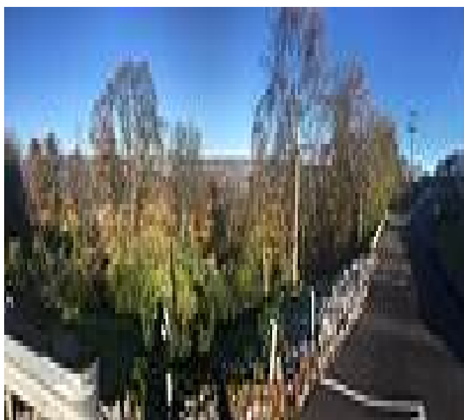
Chattanooga and Tennessee Rivers below.

The 5-mile Guild-Hardy Trail is a beautiful excursion on southern Tennessee's Lookout Mountain, only a few minutes from