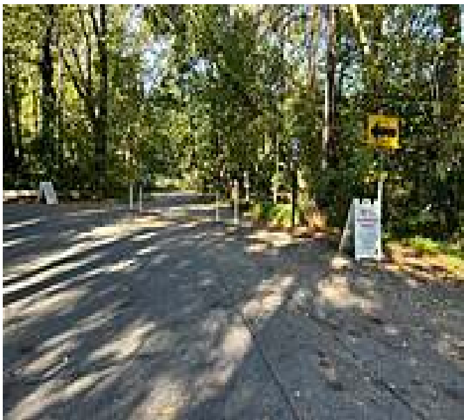
Myers Park High School.

Briar Creek Greenway is open in four disconnected segments totaling 2.9 miles in the Charlotte suburbs. The northernmost