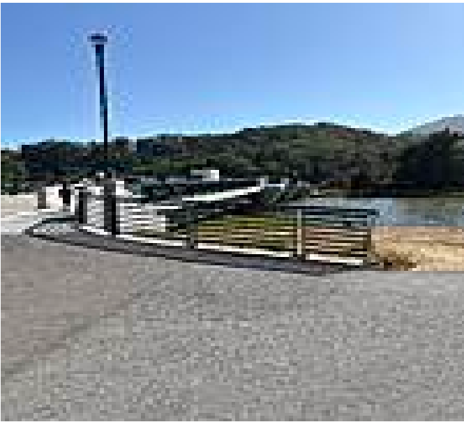
Anthony G. Bacich Elementary School.

The Bon Air Road Sidepath, as its name suggests, closely follows Bon Air Road in scenic Larkspur and Kentfield. The main trail