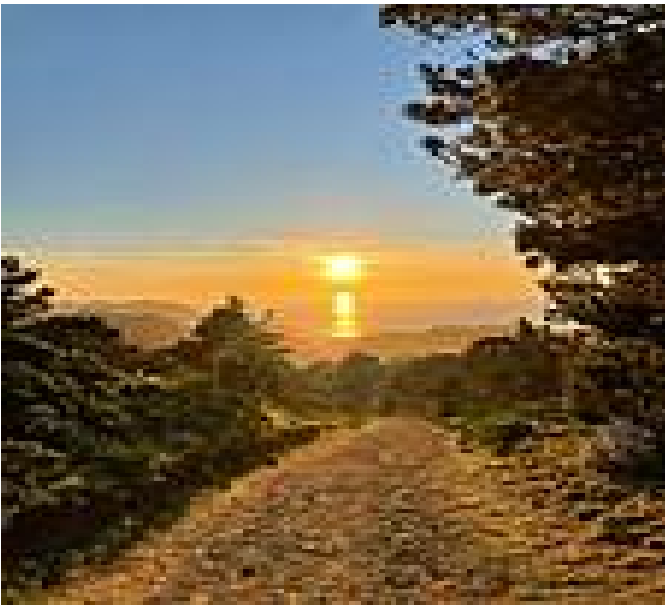
War era Nike missile site.

The Sneath Lane Trail is one trail of many in beautiful Sweeney Ridge, a prime bicycling and hiking area in San Mateo County.