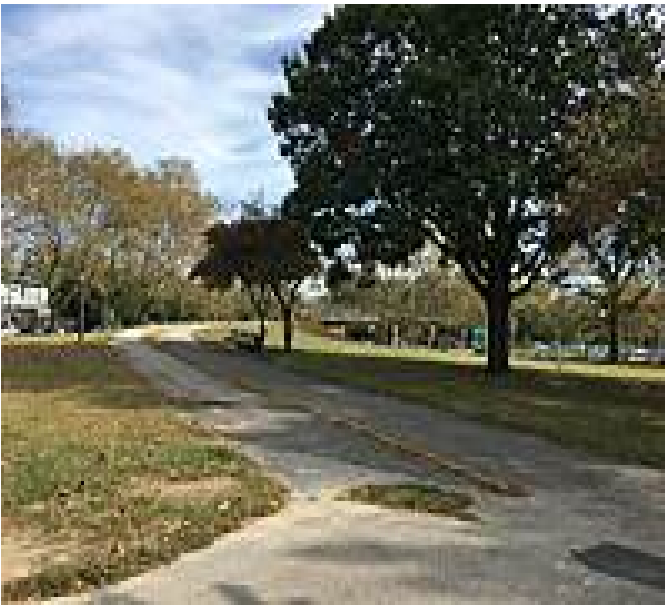
Boston-Queens Greenway network.

This trail is the legacy of the first elevated roadway in the United States, constructed by William K. Vanderbilt in 1904. Vanderbilt