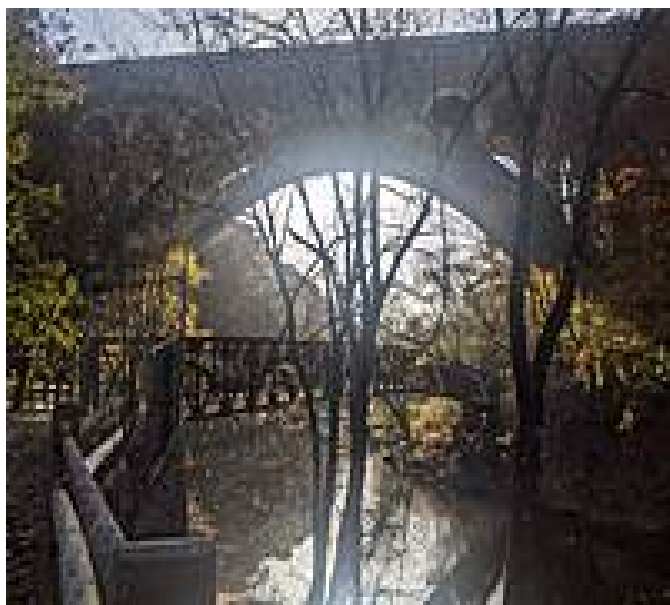
Forbidden Drive trailhead.

Running along the western edge of Wissahickon Creek, the Lincoln Drive Trail winds through Wissahickon Valley Park and offers a