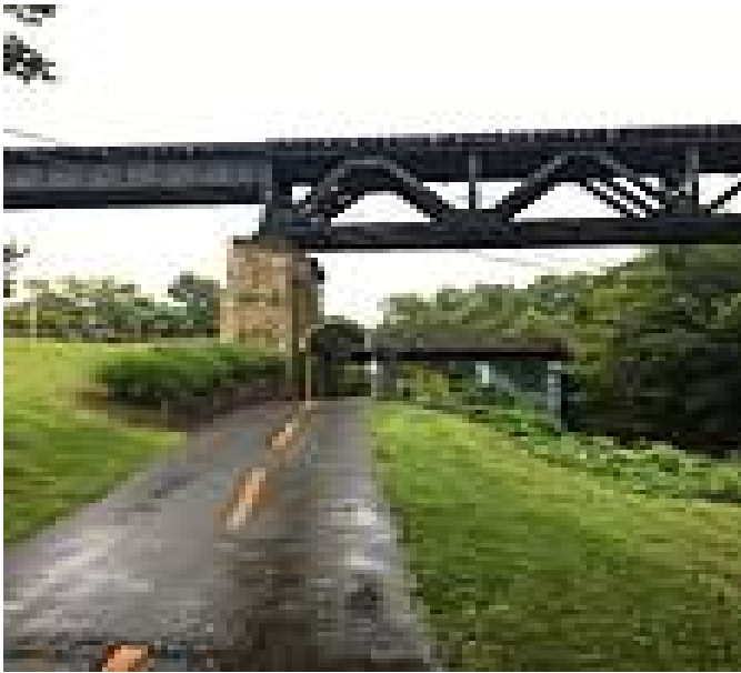
Luray from the greenway.

The Hawksbill Greenway is a 2-mile non-motorized pathway in the town of Luray, Virginia, two hours from Washington D.C. It extends