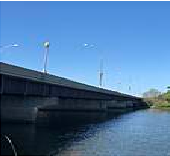
Cut State Park.

The Bauer Memorial Path provides a short route through residential and commercial areas of Machesney Park, a northern