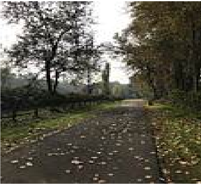
Orting and South Prairie.

The Puyallup Riverwalk Trail traces the tree-lined shoreline in northern Puyallup, a few miles southeast of Tacoma. The paved