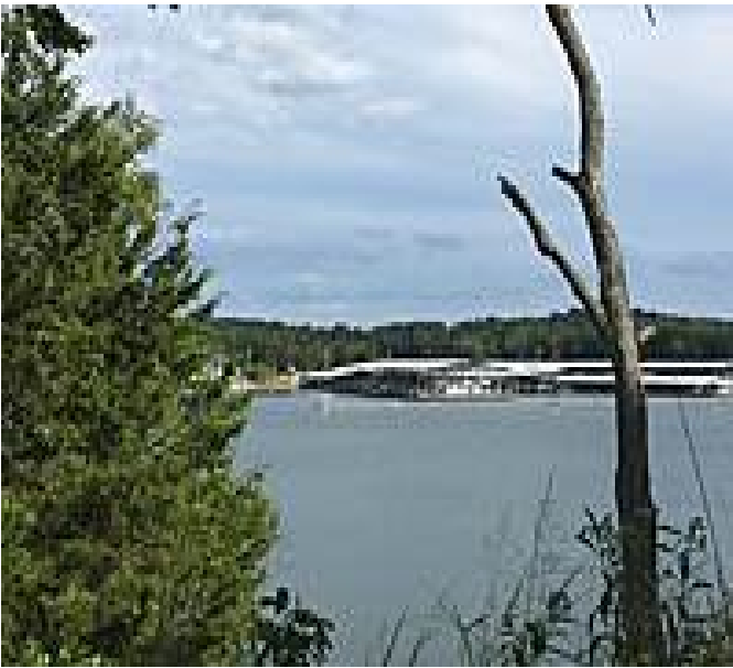
Table Rock Lakeshore Trail offers an easy, paved pathway to experience nature in southern Branson. Following the lake's shoreline, the trail winds through Table Rock State Park under a lush tree canopy for just over 2 miles. You can begin at the Dewey Short Visitor Center and follow the trail down to the the State Park Marina. Keep an eye out for wildlife, including bald eagles in the tall oaks, fox, and deer. Add variety to your outdoor excursion by fishing or swimming in the lake. Camping is also available in the park.

Table Rock Lakeshore Trail offers an easy, paved pathway to experience nature in southern Branson. Following the lake's