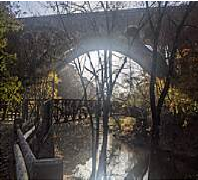
Forbidden Drive trailhead.

Running along the western edge of Wissahickon Creek, the Lincoln Drive Trail winds through Wissahickon Valley Park and offers a